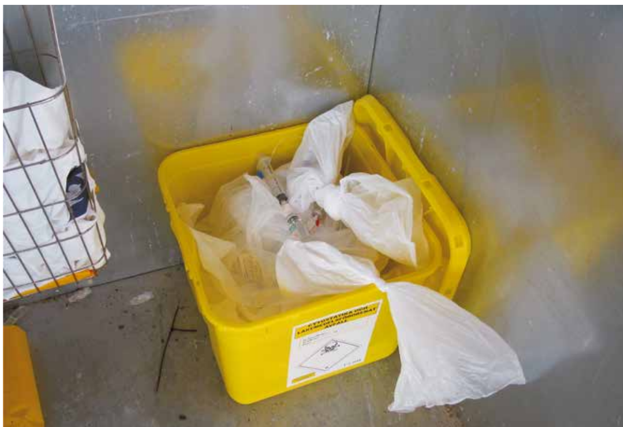
Healthcare waste is segregated and stored in clearly distinguished yellow container awaiting disposal.

Further Resources to support implementation in the field. Please contact the Environmental Emergencies Centre: www.eecentre.org and use the “contact us” button.