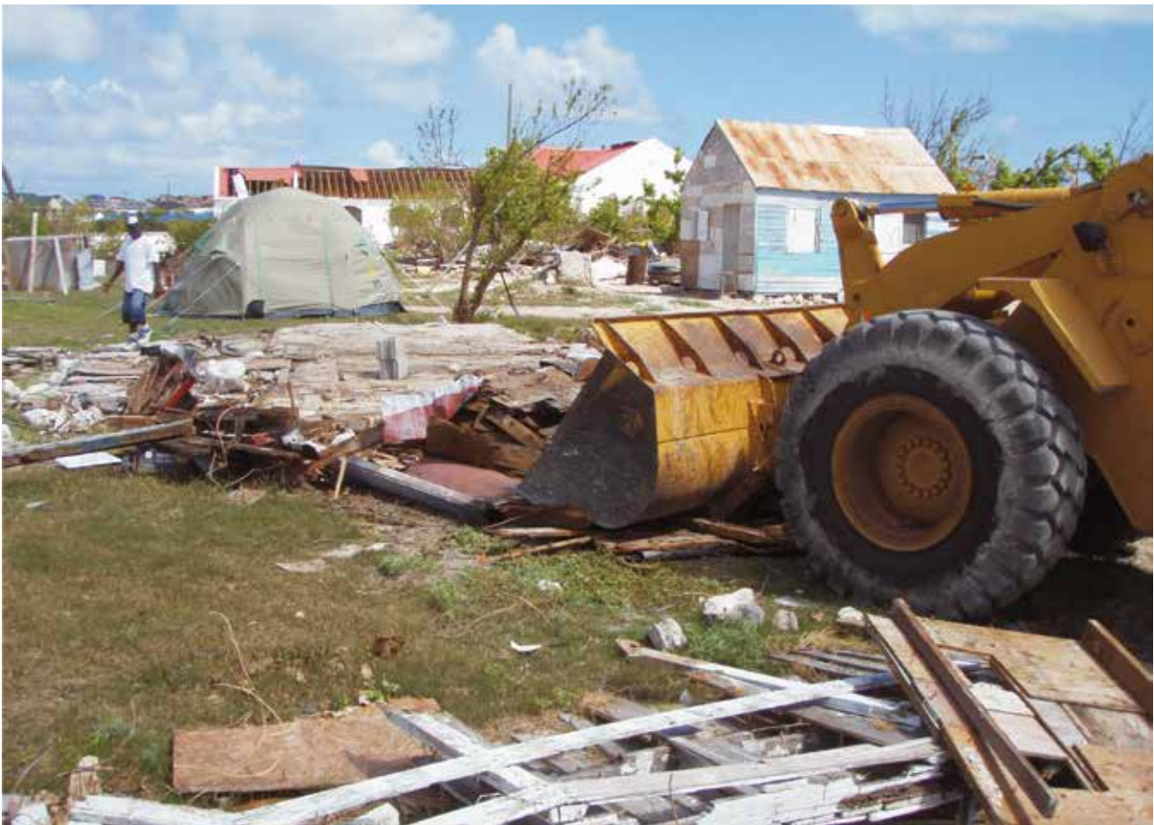
Clearing hurricane debris in post-hurricane Turks and Caicos Island 2008. Note the lack of appropriate equipment to segregate roofing and reusable boards.