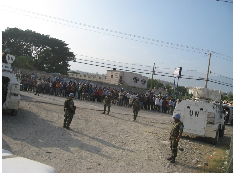
Security forces outside USAR BoO.

Port-au-Prince was already before the earthquake divided in green and red zone (areas which would require armed escorts). Mainly the harbour area, from Cité Soleil towards the south and Carrefour, was considered a red area where military escort was necessary. This had a huge impact on the USAR operations, as there was insufficient capacity in UNPOL and MINUSTAH to facilitate the required deployments in the red zones.