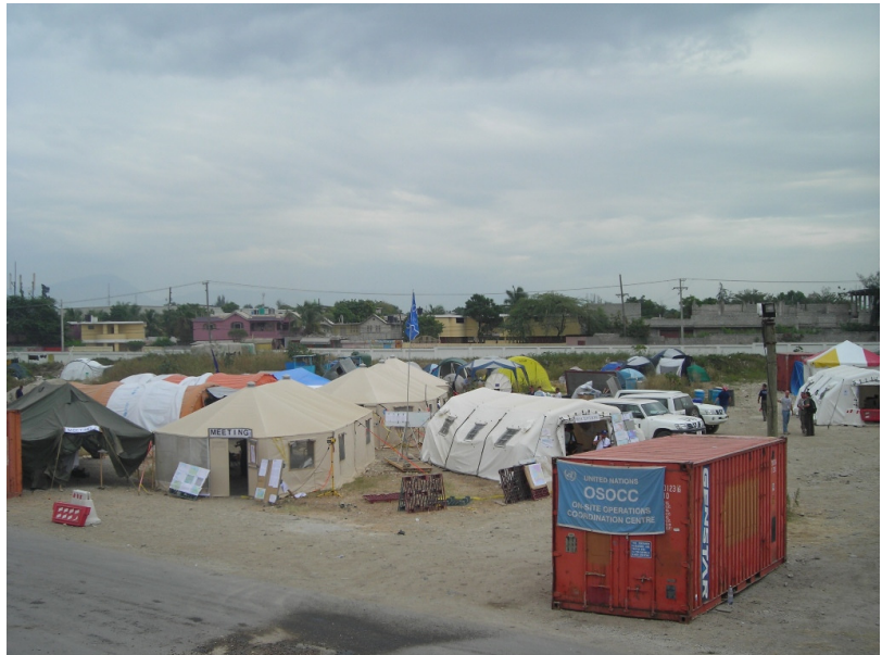
OSOCC in Port-au-Prince.

Due to the fact that many of international USAR teams as well as humanitarian organizations were flying to Port-au-Prince via Santo Domingo, Dominican Republic, a second RDC was established at the international airport of Santo Domingo under the leadership of the UNDAC team which was deployed to