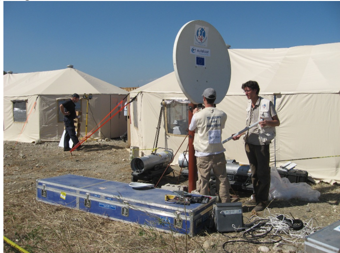
TSF working on VSAT outside the main OSOCC.

Even where the technology failed in the face of the harsh conditions and circumstances, the same cannot be said of the staff and users. Even in the harshest conditions, the UNDAC Support Team remained cheerful, hard working and dedicated to the success of the mission. As a consequence, there were no massive ICT failures that halted operations. Other than the Internet connection, everyone was always able to work, even though at times the Wireless LAN was slow. Every failure was addressed within minutes of it being noticed and the ICT support process