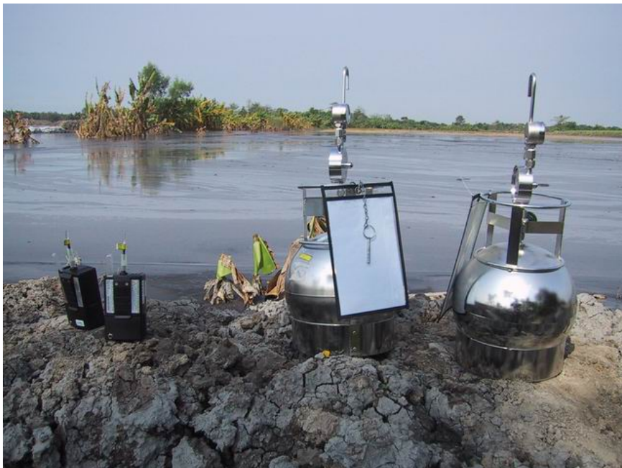
Sophisticated equipment was used to measure air quality.

It is assumed that the hydrogen sulphide was contained in the over pressurised mud layer. During the site visits and sample taking, detectors were used (to ensure on-site safety of the team) and no hydrogen sulphide was detected. In addition, large numbers of people on and near the mud volcano confirmed that no release of toxic gases was taking place.