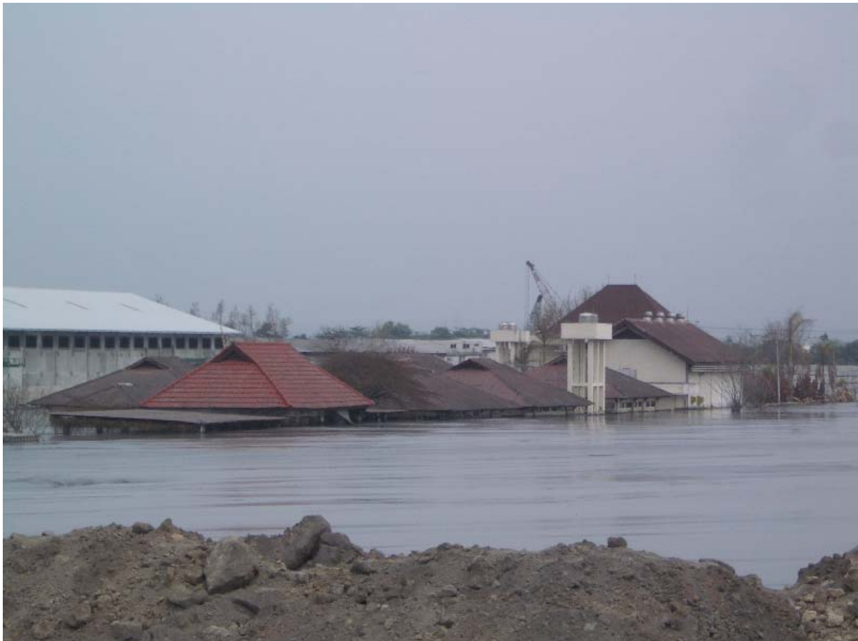
The continuous mudflow has submerged various villages.